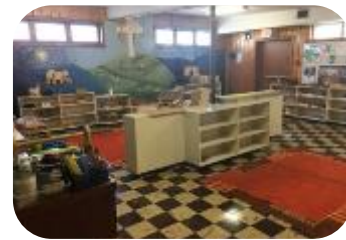
Back of Classroom