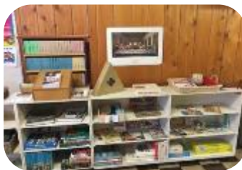
Holy Bible & New Testament Sacred Stories