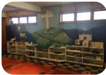
Front of Classroom

If you would like to share pictures of your Godly Play classroom in a future issue, please contact us!