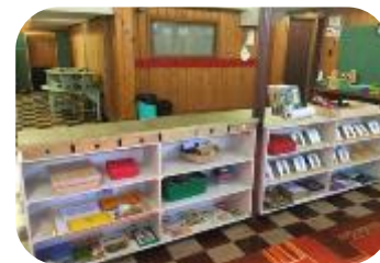
Parables & Saints