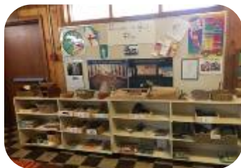
Old Testament Sacred Stories