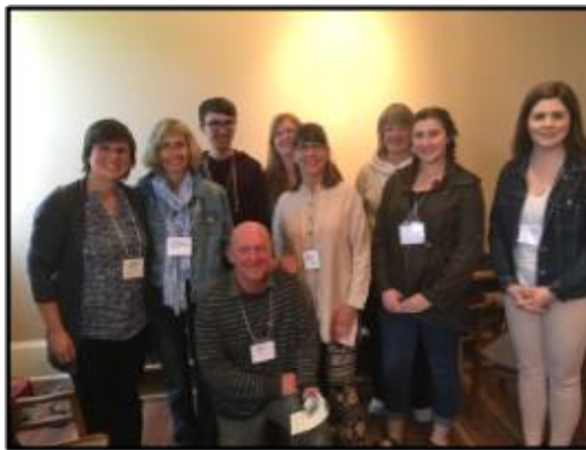
Godly Play Core Training, Oak Bay United Church, June 2017

Please register online at: www.emmanuel.utoronto.ca/coned/htm