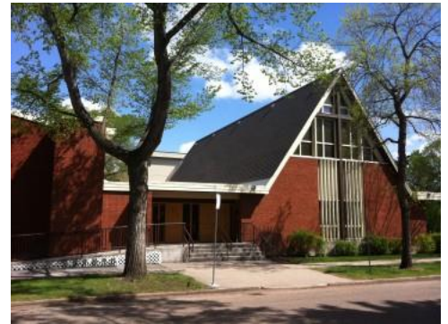
St. Paul's United Church, Edmonton